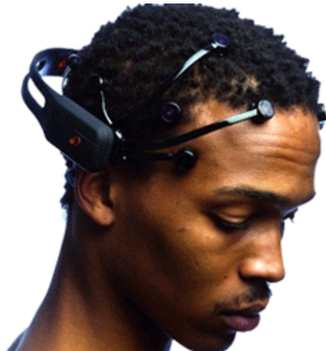
Figure 3. The Emotiv offers consumers access to a technology which was, until recently, confined to medical environments. Image by Emotiv (2014).

The perfect BCI would be a device which is cheap, accurate and unobtrusive. It would also have to sport a long battery life. This technology does not exist yet, but it has not stopped some daring entrepreneurs to dream out loud and develop amazing consumer devices and applications revolving around brain imaging.